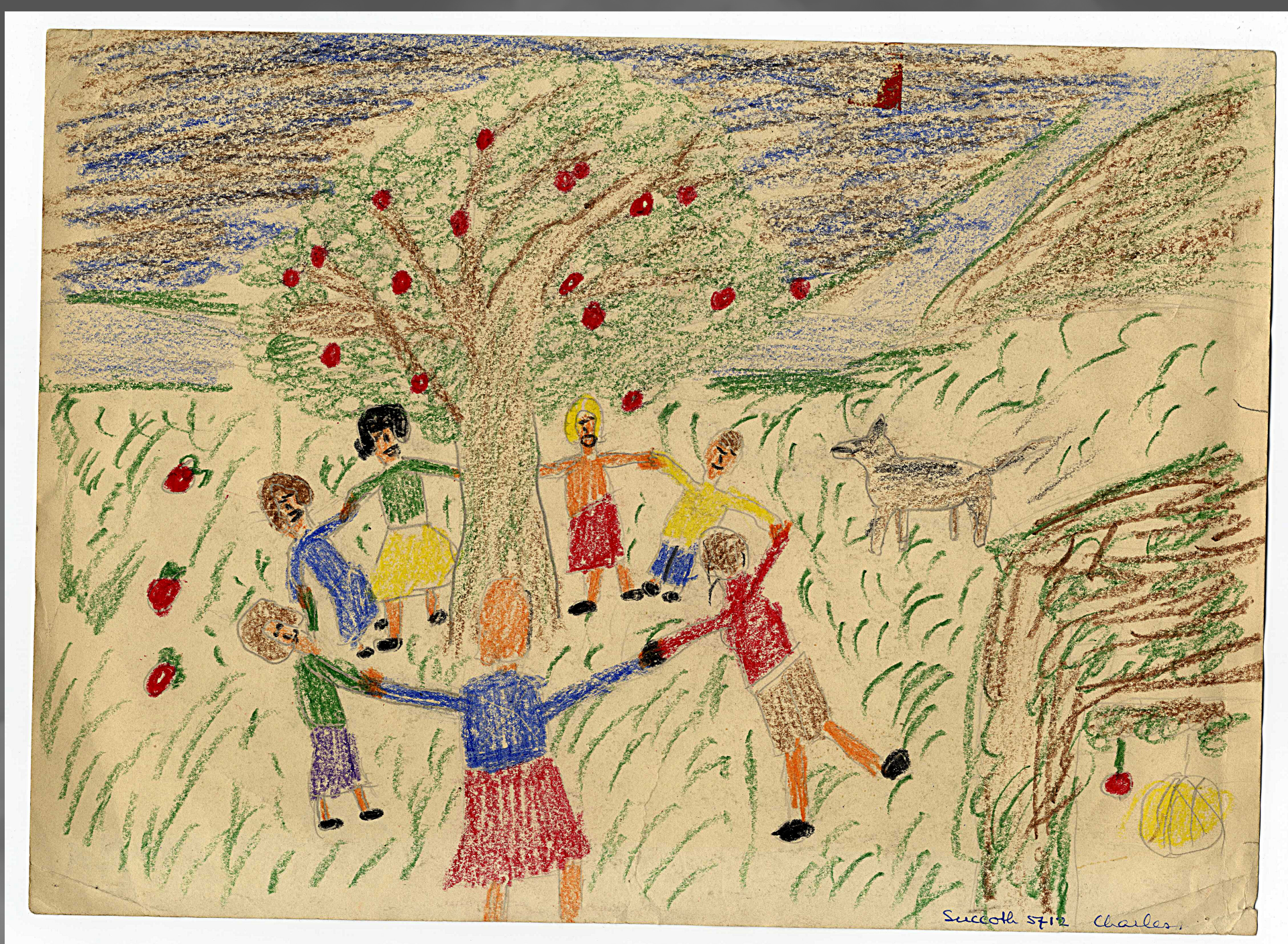
Drawing of a child survivor, postwar UK